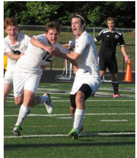
The winning kick!