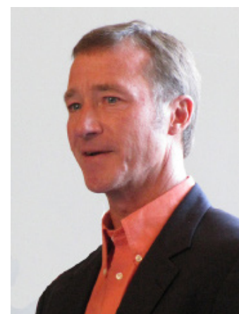
Former Mayor Deke Copenhaver