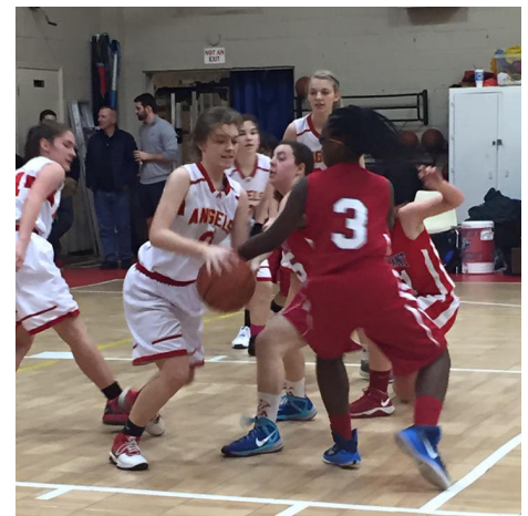
JV Girls against Faith Covenant

Drinking spiritual fluids in the morning and throughout the day: that's the point. Stay hydrated, my friends.